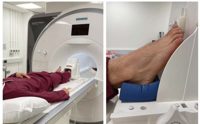
Figure 1: MR set up with the participant's heel loaded on a soft cushion.

Results: The high-resolution MR acquisitions allowed a clear distinction of the tissues that compose the human heel and their displacements due to the application of the various loads (Figure 2). As expected, the implementation of a mattress on the supporting surface reduced the amount of deformation and strains. Conversely, the loading configuration involving the indenter generated the highest levels of max Green Lagrange shear strain.